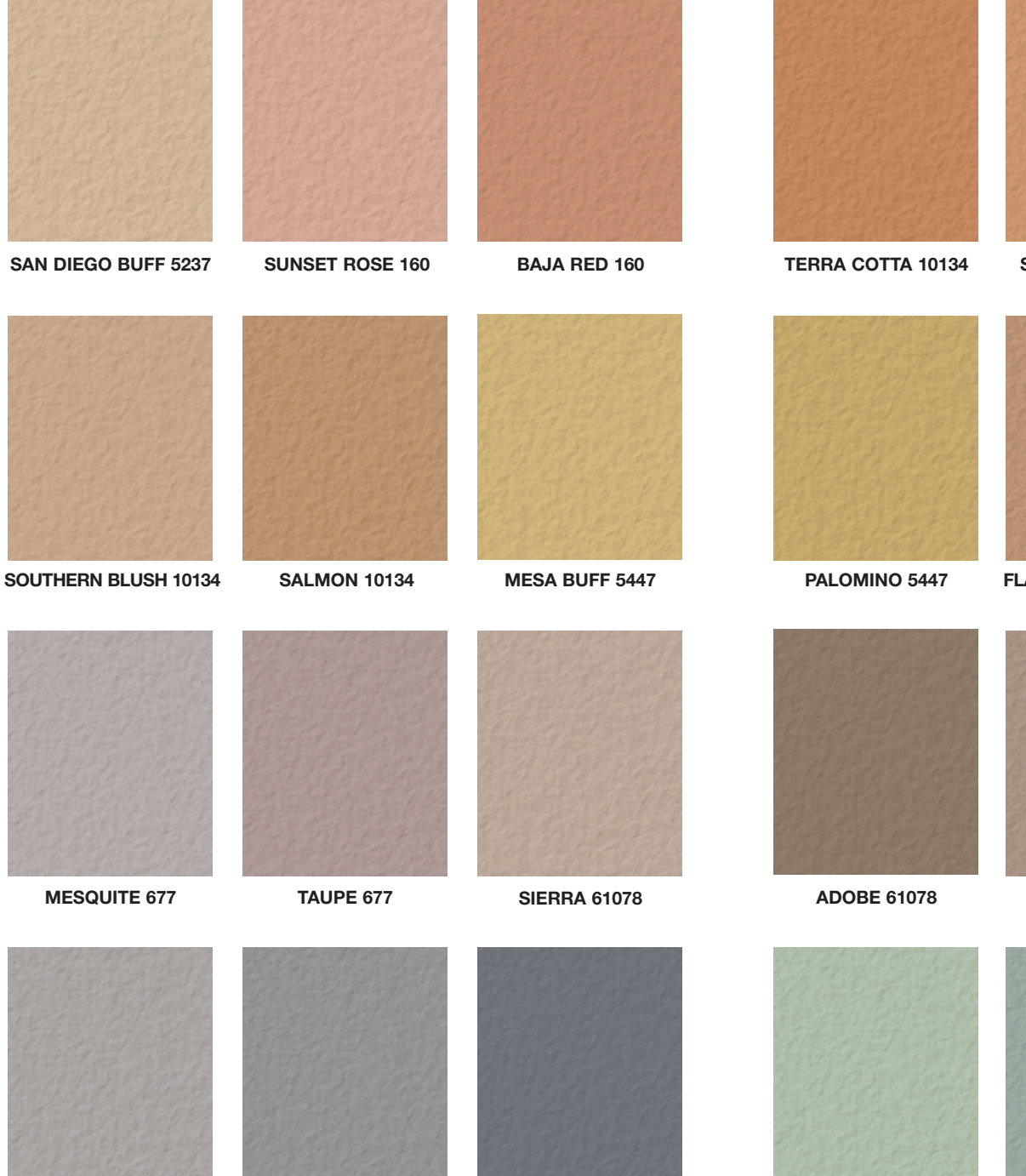
WILLOW GREEN 5376